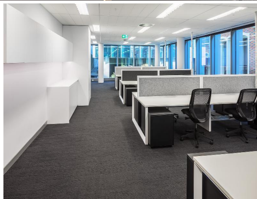
LEVEL 2, ANNEX BUILDING, 585 HAY STREET - 15 SEATS