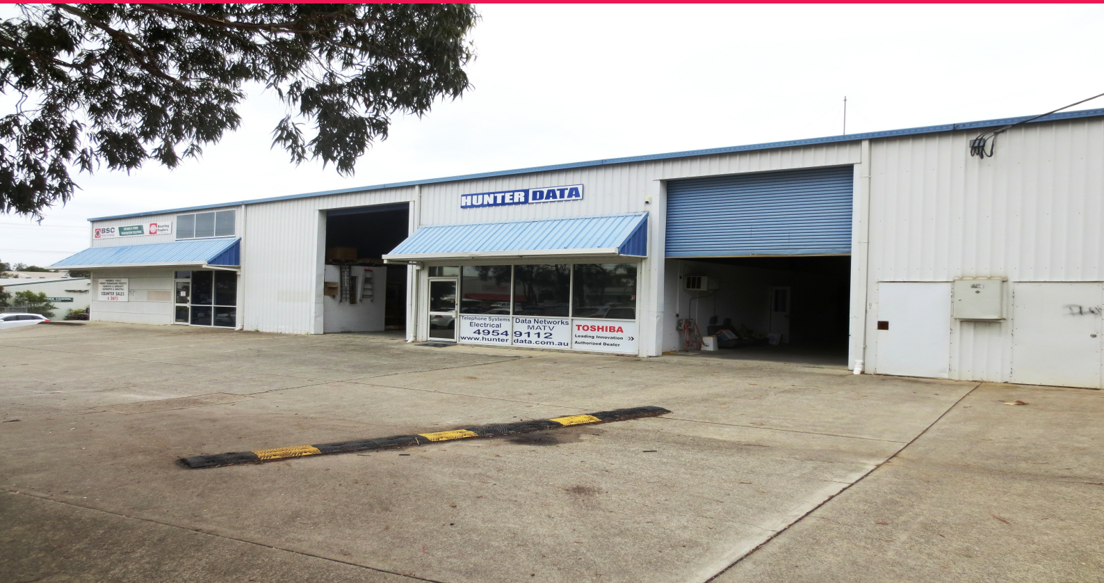
Unit 2, 112 Mitchell Road, CARDIFF