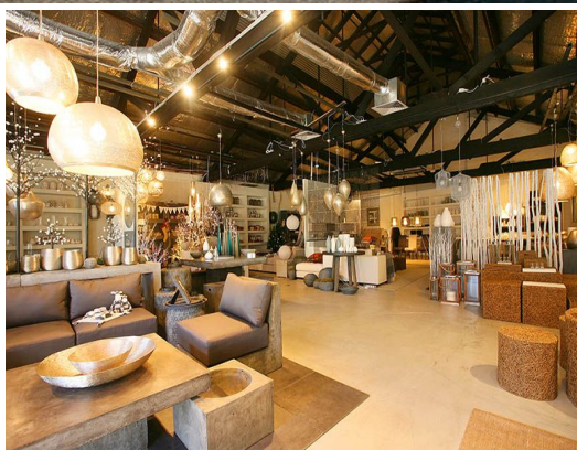
3-5 George Street, Leichhardt