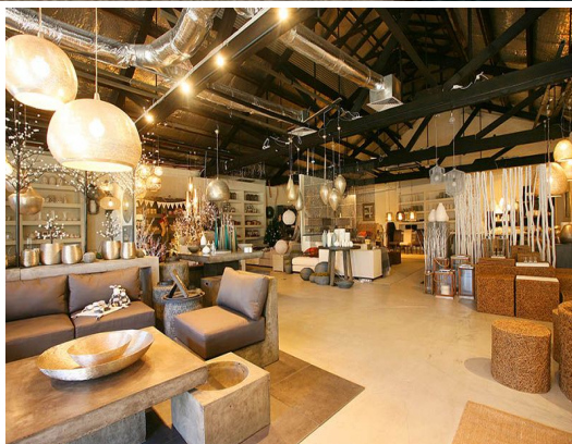
3-5 George Street, Leichhardt