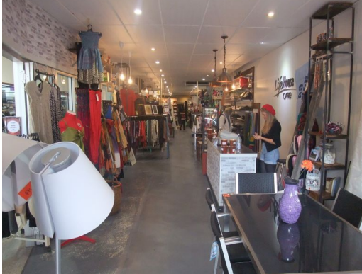
Shop 2/36-38 Harbour Drive, Coffs Harbour NSW 2450