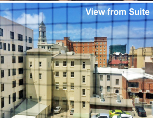
View from Suite