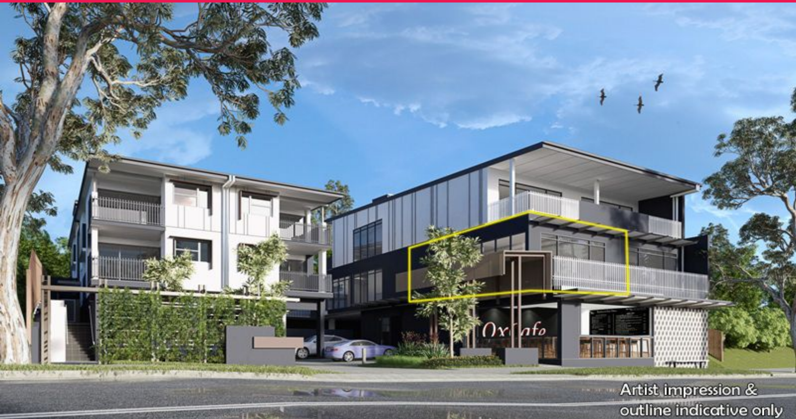
Artist impression & outline indicative only