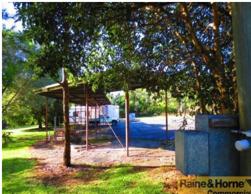
199 Sunnydene Road, Capalaba West QLD 4157