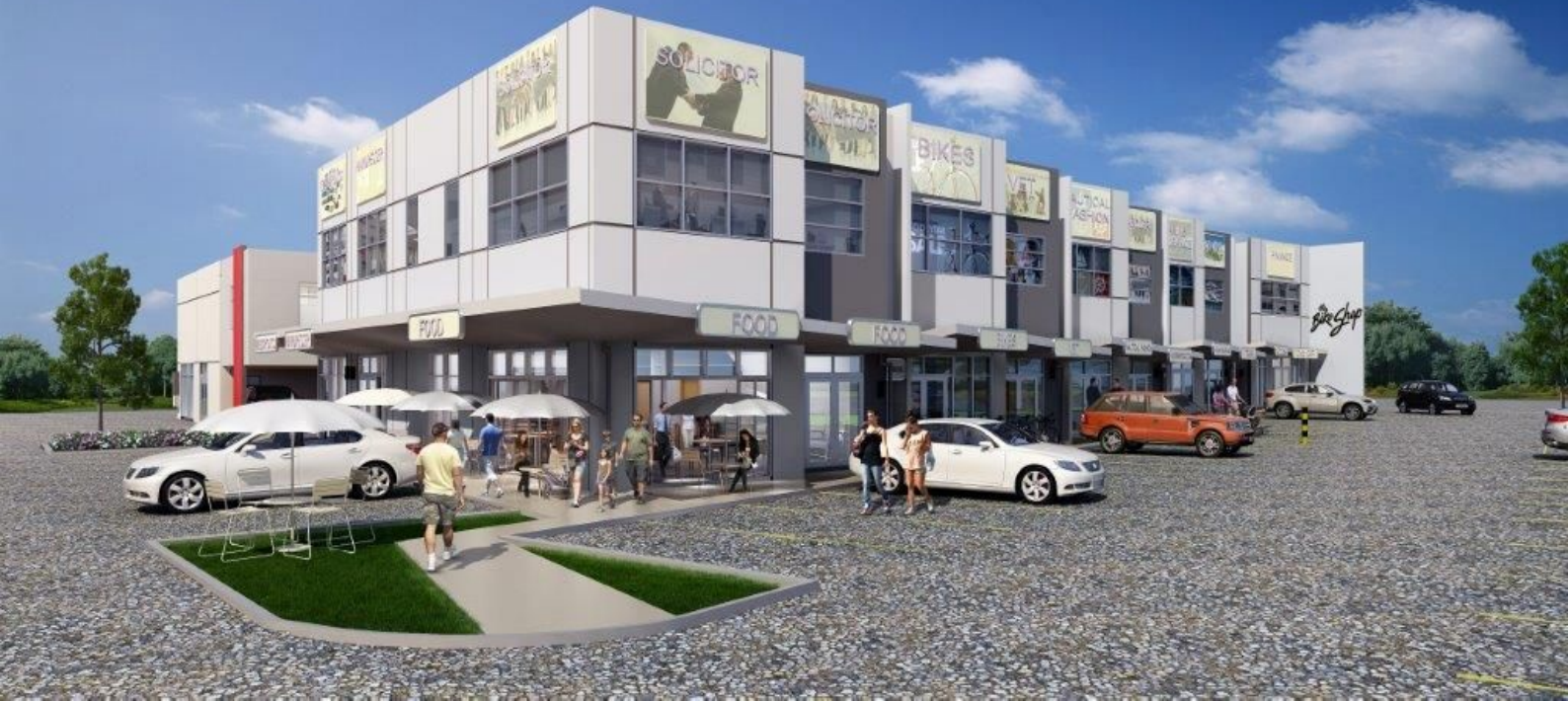
Tingalpa Central Units 22-26