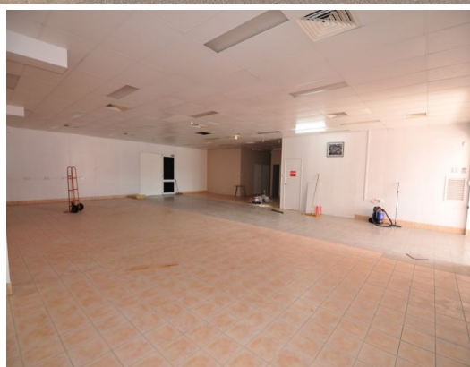
178 HUGH STREET, CURRAJONG TWO STOREY OFFICE AND WAREHOUSE UNIT TOTAL FLOOR AREA: 420sqm