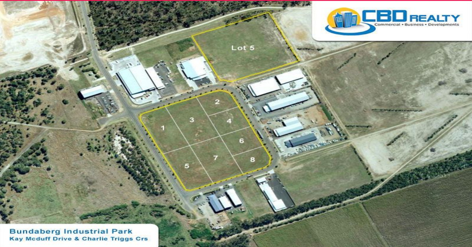
Bundaberg Industrial Park Kay McDuff Drive & Charlie Triggs Crs