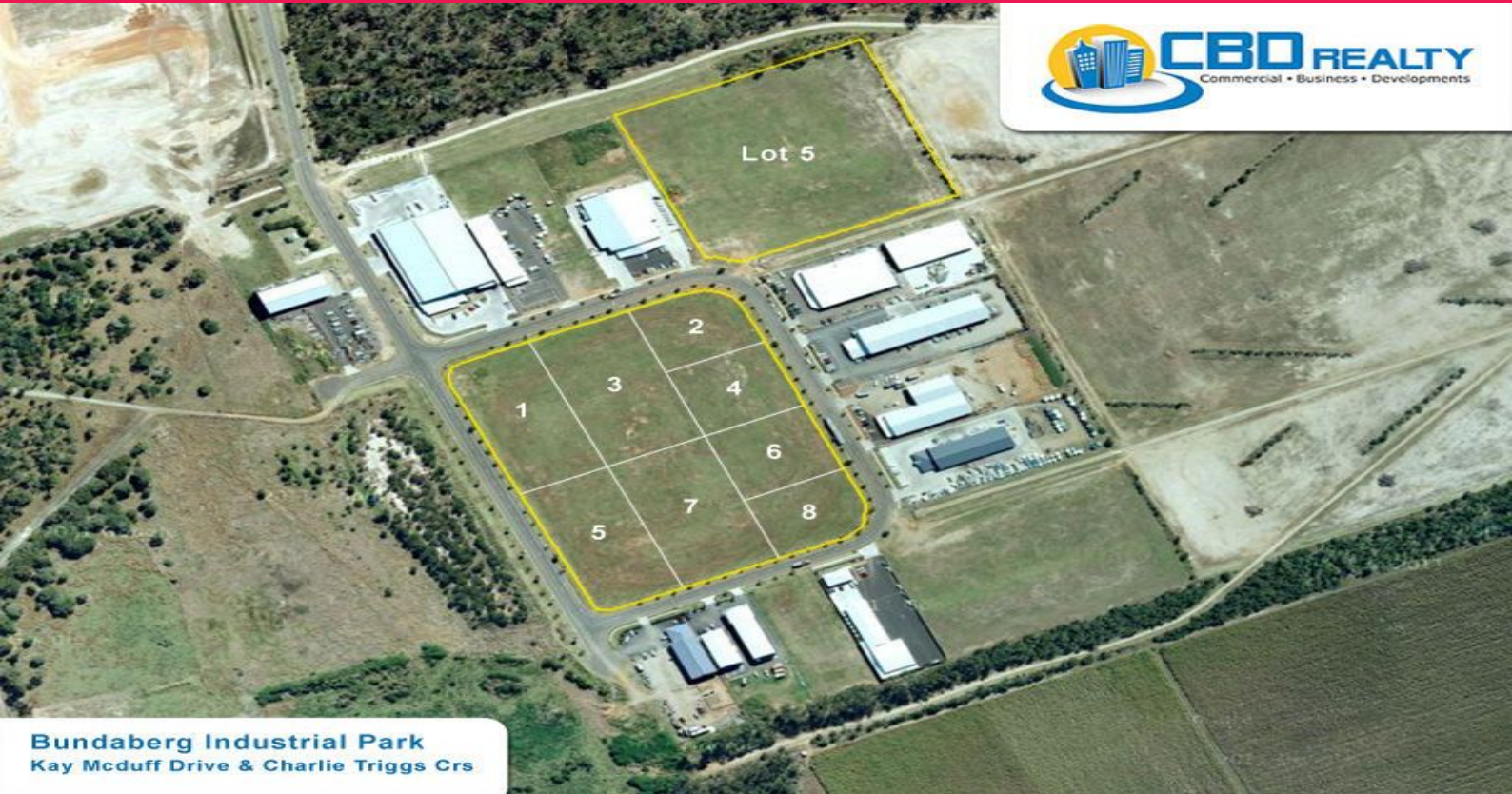
Bundaberg Industrial Park Kay McDuff Drive & Charlie Triggs Crs