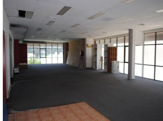
3/3267 Logan Rd, Underwood QLD 4119