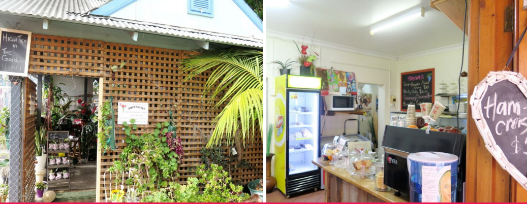
18 Railway St, Woy Woy NSW 2256