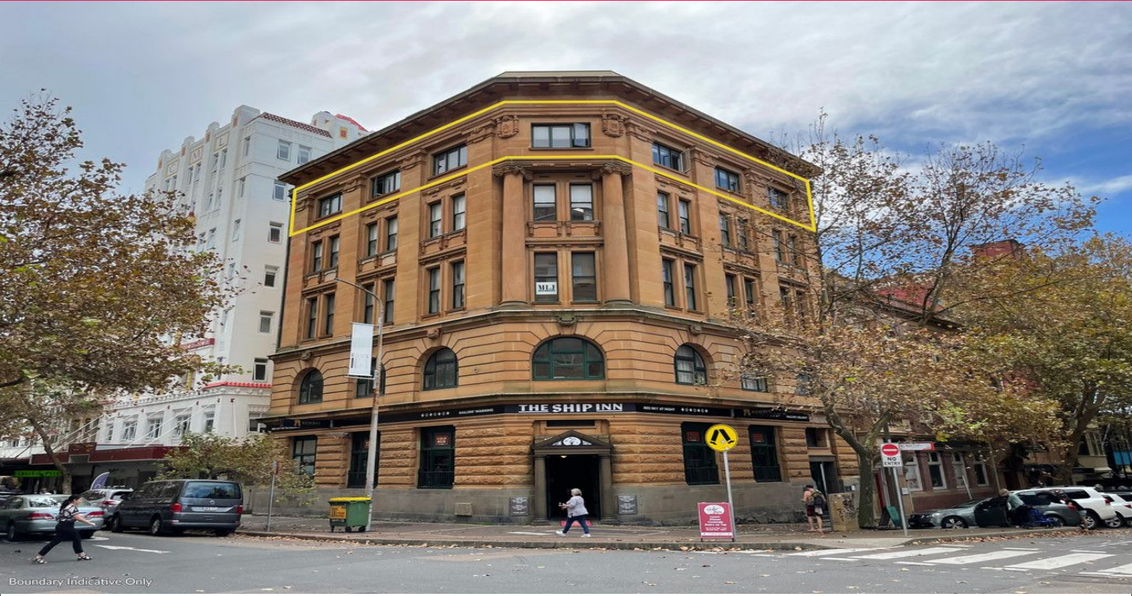
Boundary Indicative Only