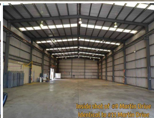
Inside shot of #9 Martin Drive Identical to #11 Martin Drive