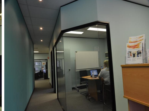
Unit 9/103 Glenwood Drive, Thornton NSW 2322