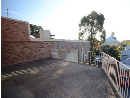
Rear Unit/152 Darby Street, Cooks Hill NSW 2300