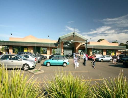
Shop 6 Erskine Park Shopping Village, Penrith NSW 2750