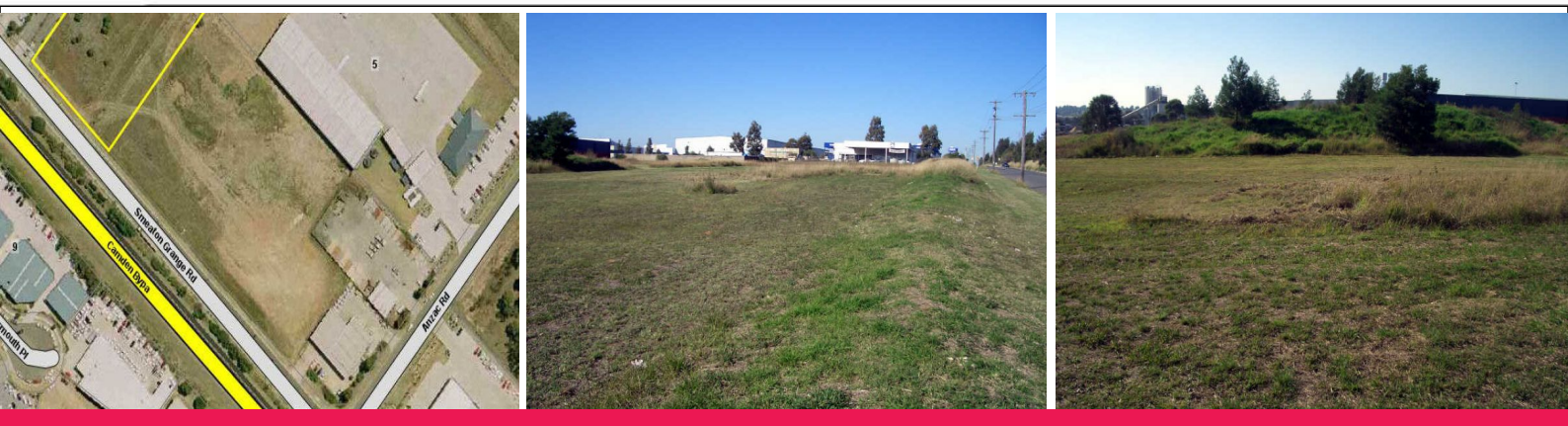
Lot 4 Smeaton Grange Road, Smeaton Grange NSW 2567