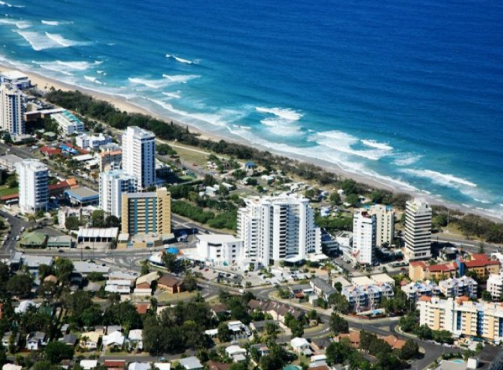
Ste 4 / 14 Aerodrome Road, Maroochydore QLD 4558