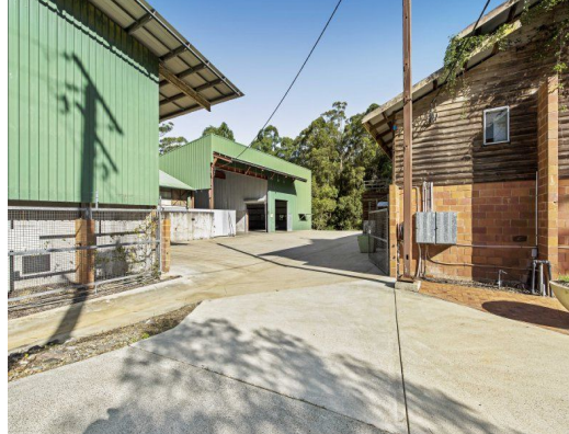
Shed C / 70 Wilson Road, Ilkley QLD 4554