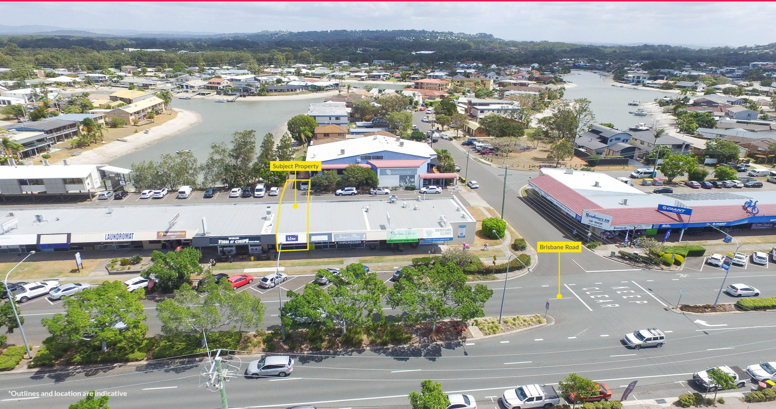
*Outlines and location are indicative