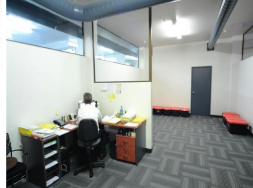
Suite 2, Ground Fl/2 Darby Street, Cooks Hill NSW 2300