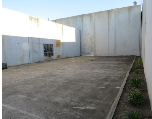
3/22 Salicki Avenue, Epping VIC 3076