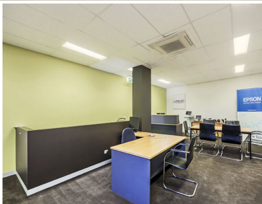
6/ 29-31 Clarice Road, BOX HILL SOUTH