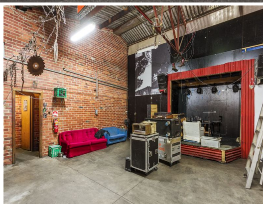
12 French Street, COBURG NORTH