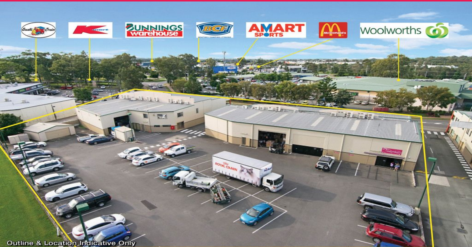
Outline & Location Indicative Only