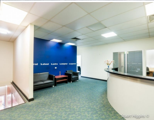
Stuart Higgins ©