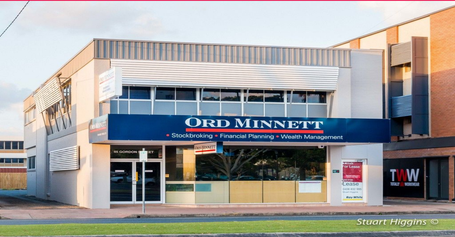
Stuart Higgins ©