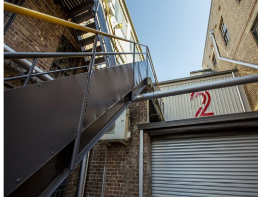
75 Mary Street, St Peters NSW 2044