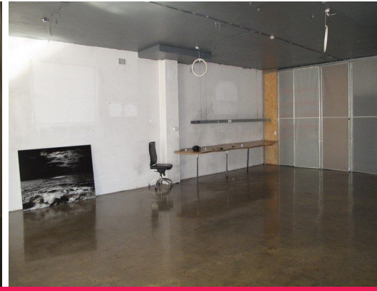
2c/136 Raglan Street, Waterloo NSW 2017