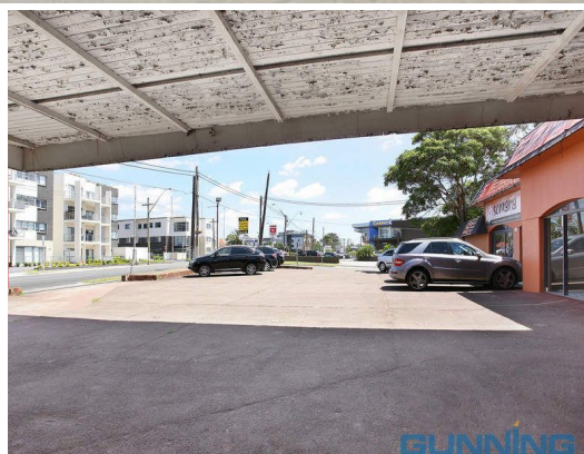
152 Rocky Point Road, KOGARAH