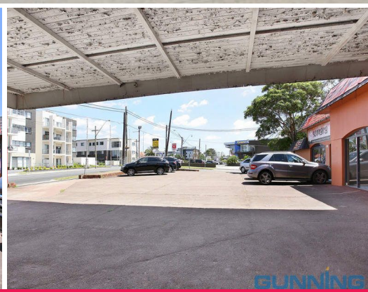
152 Rocky Point Road, KOGARAH