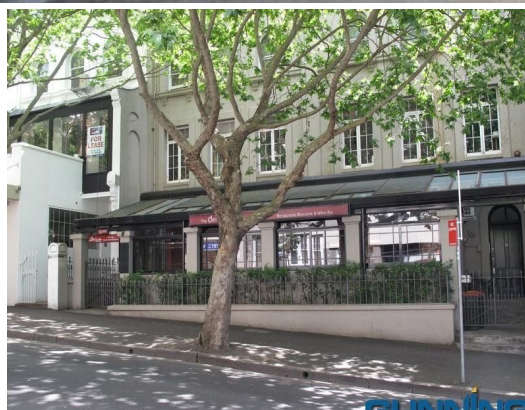
32 Bayswater, POTTS POINT