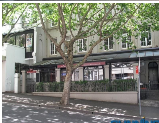
32 Bayswater, POTTS POINT