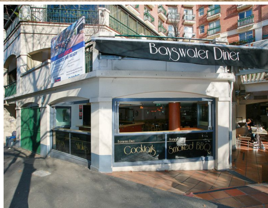
33 Bayswater Road, POTTS POINT