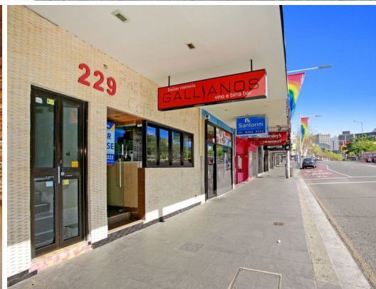
229 Oxford Street, DARLINGHURST