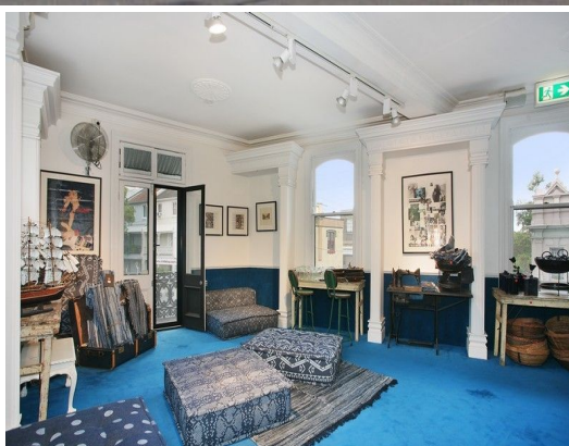
507 Crown Street, SURRY HILLS