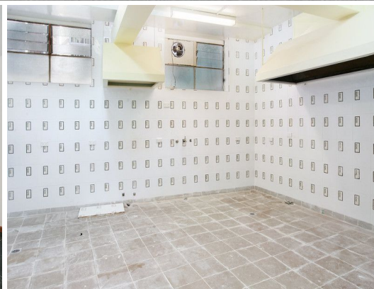
457 Elizabeth Street, SURRY HILLS