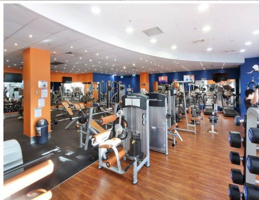
201/7-11 The Avenue, HURSTVILLE