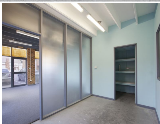
3/22-24 Rhur Street, Dandenong South