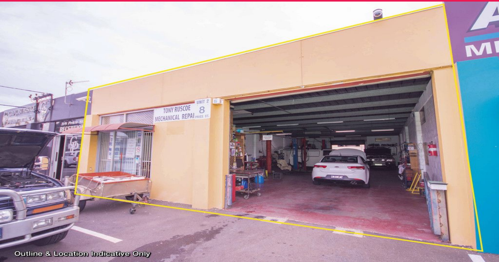
Outline & Location Indicative Only