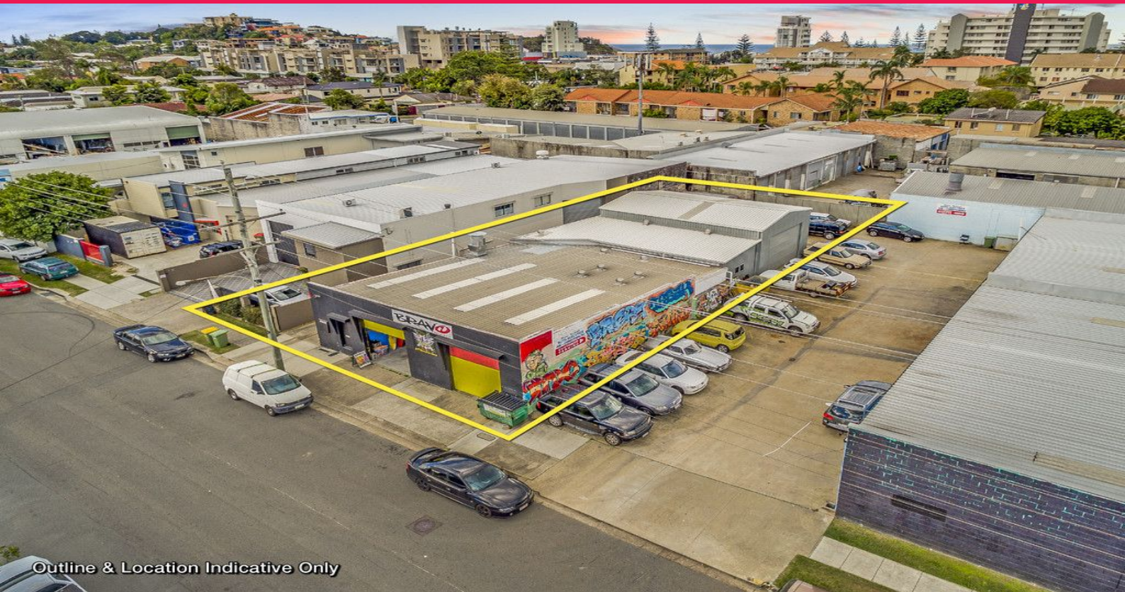
Outline & Location Indicative Only