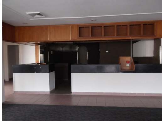
, Tamworth NSW 2340