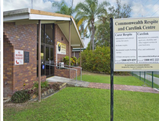
19 Hayes Street, Caboolture QLD 4510