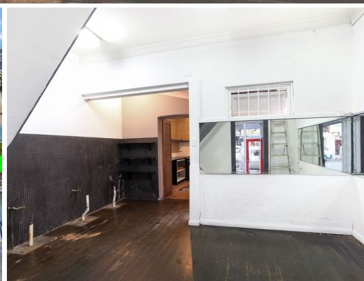
565 Crown Street, SURRY HILLS