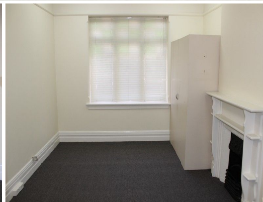
8 Ormonde Parade, HURSTVILLE