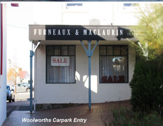
4 Gregory Street, Sandy Bay. Building area: 82 sq metres.