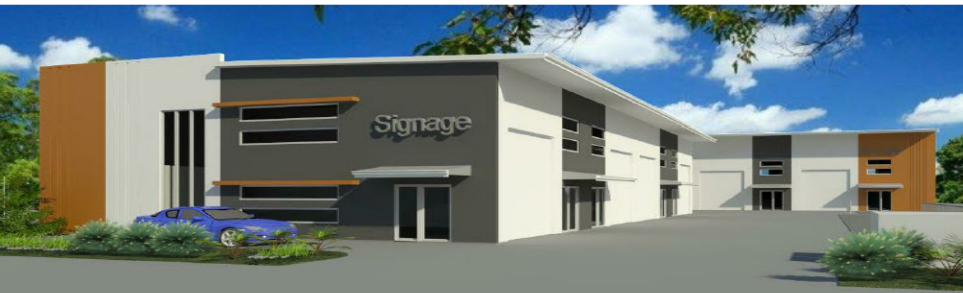
SOUTH 3D VIEW