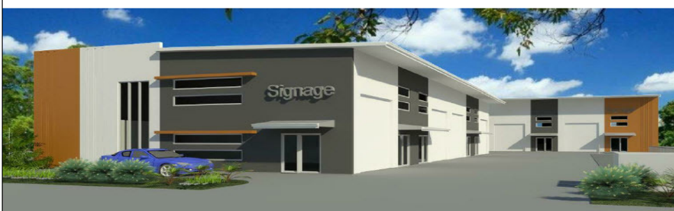
SOUTH 3D VIEW