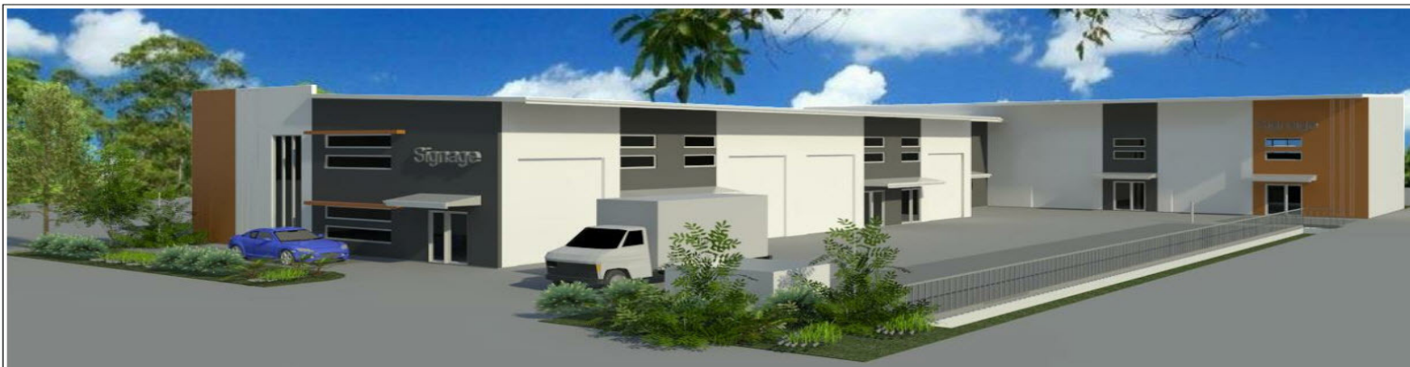
SOUTH EAST 3D VIEW