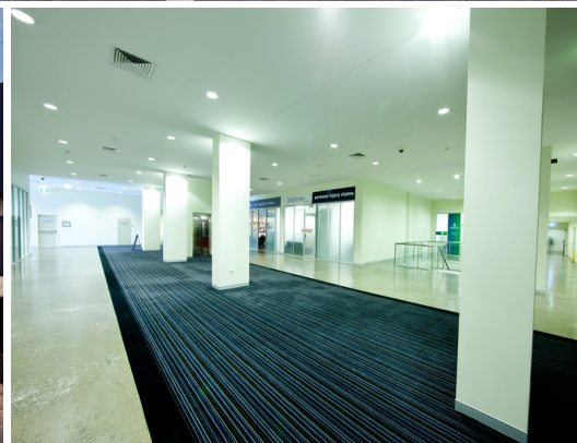
Tenancy C3 - Upper Level 497m 2 N/A Subject to survey