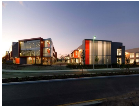
BUILDING 2.01 TENANCY 1