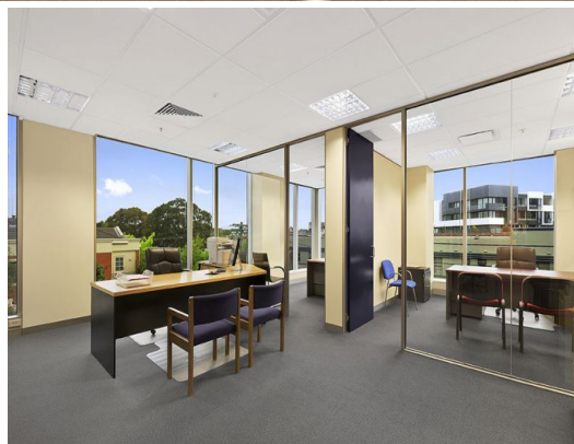
314/737 Burwood Road HAWTHORN EAST