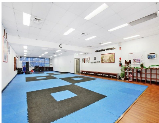
7 Barratt Street, HURSTVILLE