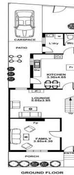
204 EDGECLIFF RD BONDI JUNCTION